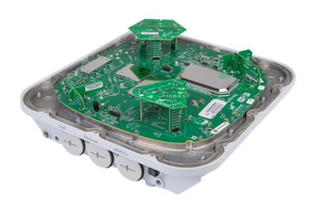
RUCKUS BeamFlex<sup>®</sup> Smart Adaptive Antenna