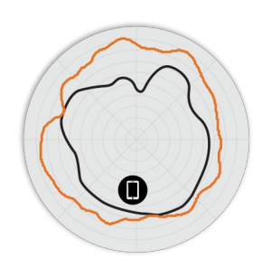
Figure 7. T670 6GHz Elevation Antenna Patterns