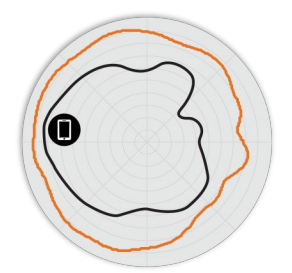
Figure 5. T670 2.4GHz Elevation Antenna Patterns