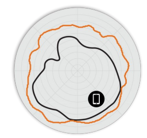
Figure 6. T670 5GHz Elevation Antenna Patterns